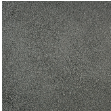
AM07 | ANTHRACITE