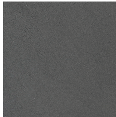
AM13 | SLATE