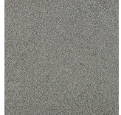
AM05 | FLINT