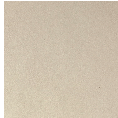
AM09 | TAUPE