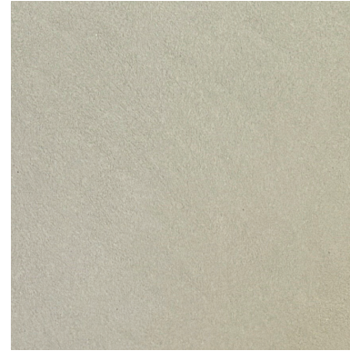
AM04 | ASH