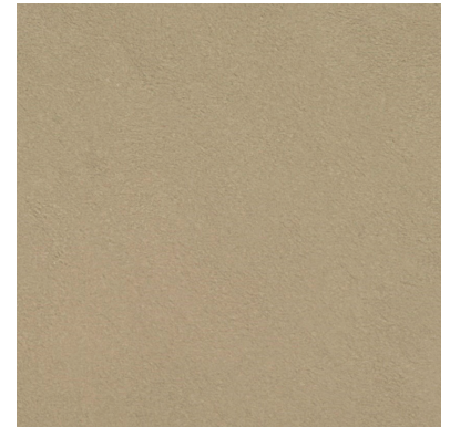
AM10 | GREIGE