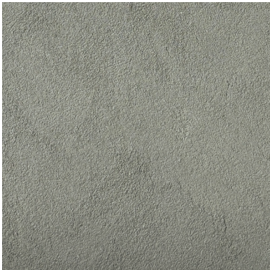
AM06 | GRAPHITE