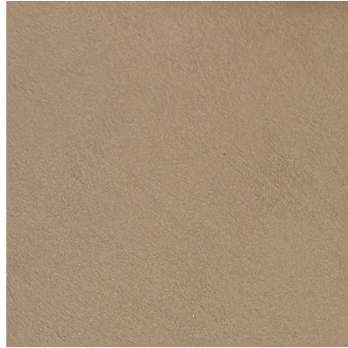
AM02 | SANDSTONE