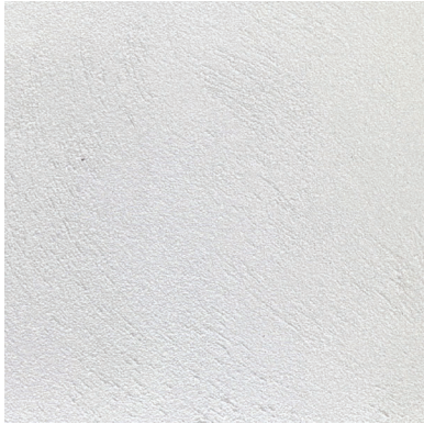
AM01 | ARCTIC