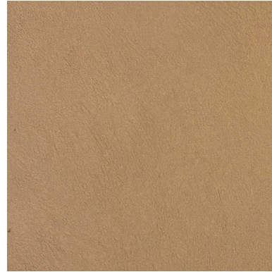
AM03 | CLAY