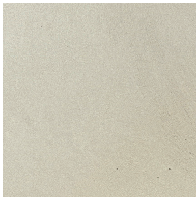
AM11 | MIST