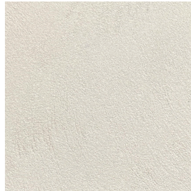
AM08 | IVORY